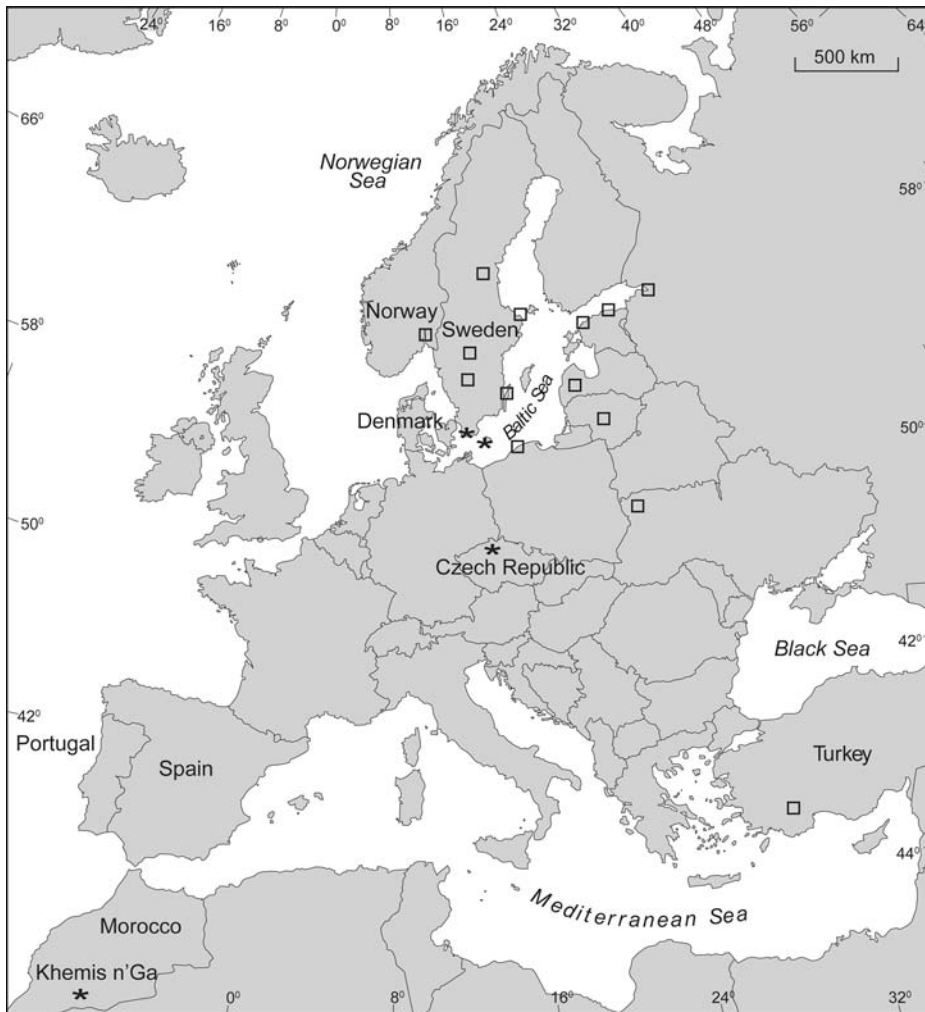
Fig. 1. Map showing the locations with Barrandegnathus n. gen. (*) and Baltic Province conodonts (□) in Europe, Turkey and northwest Africa. The Baltic Province conodont fauna is found in Baltica, Gondwana (Morocco), (West) Avalonia (Ganderia-New Brunswick) and South China. Barrandegnathus is 'endemic' to the Tornquist Sea. The Baltic Province conodont fauna is found on Baltica and on continents that rifted and drifted away from Gondwana (i.e. Avalonia) and moved from high to mid high latitudes (or from low latitudes to mid latitudes i.e. South China) on the southern hemisphere.

The discovery of the same taxa from southwestern Scandinavia presented here does provide links from Perunica to Gondwana and Baltica. The record of the taxa in southwestern Scandinavia is from deep shelf environments. The fauna provides precise correlation between the deposits of the East European/Baltic Platform and the Prague Basin within the brief time interval of the early Mid Ordovician (i.e. within the upper Volkhov Regional Stage). In addition it provides new information to the previous ideas on faunal communication (e.g. Dzik 1983a, b; Gutiérrez-Marco et al. 1999) between the Perunica terrane, West Gondwana supercontinent and Baltica continent.