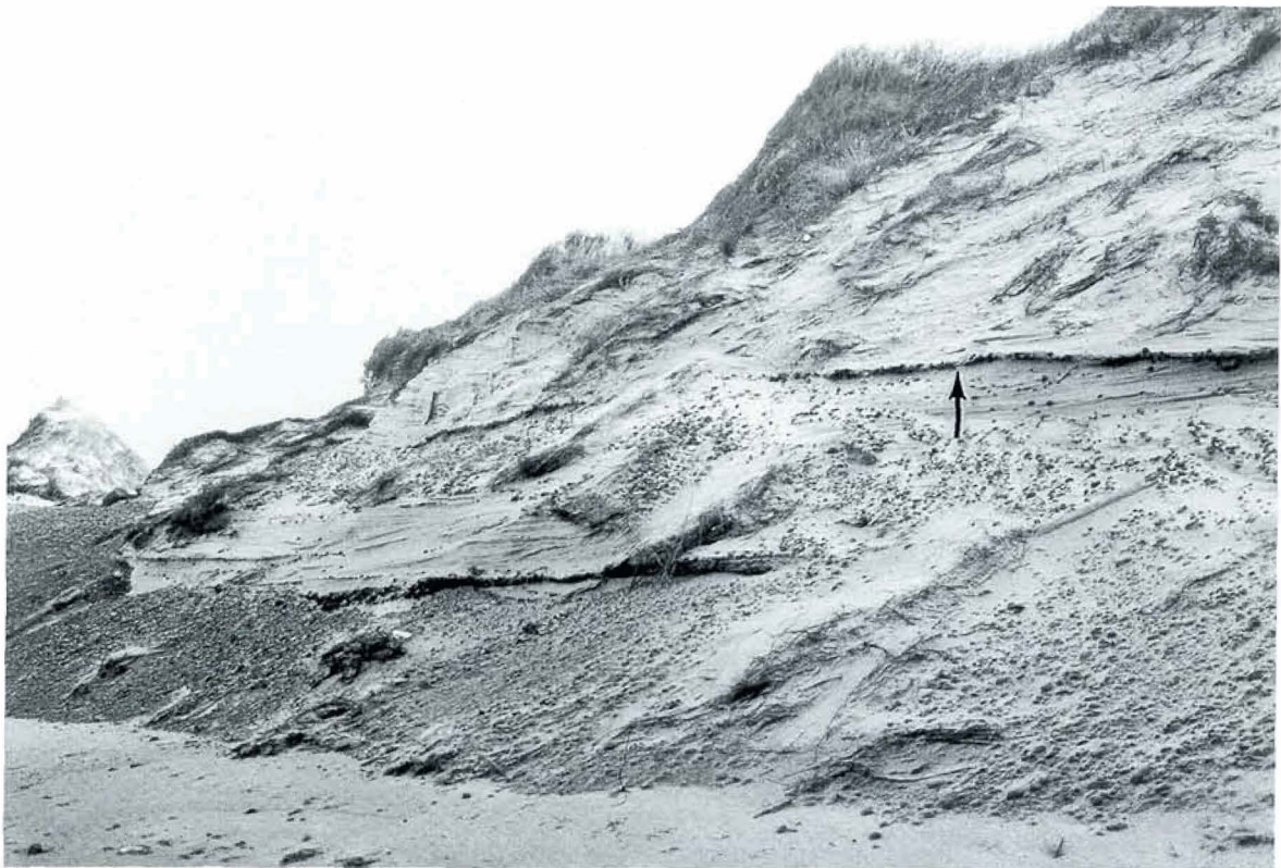
Fig. 1. Section of spit deposits, coastal cliff south of Højen, Skagen Odde. Note the prominent stone horizon (arrow) that separates lowermost shoreface and beach deposits of pebbly sand and gravel from uppermost dune deposits of well-sorted sand. The stone horizon is interpreted as a deflation lag and most likely formed during the Little Ice Age, when severe wind erosion and sand drift took place. Part of the deflation plain, which can be seen to the left, was later overlain by dunes. The stone horizon occurs c. 5 m above sea level.

Hauerbach (1992) noted the occurrence of a rather continuous stone horizon in cliff sections at the west