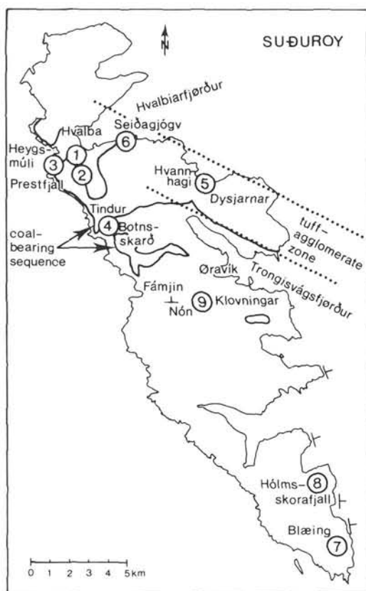
Fig. 1. Sketch map of Suðuroy.

road (fig. 1, loc. 2). It has the appearance of an earth tongue or lobe. Its extension along the road is nearly 300 m, and it extends downhill until about 25 m a.s.l. Many stones are strewn on the surface of the distal part of the lobe.