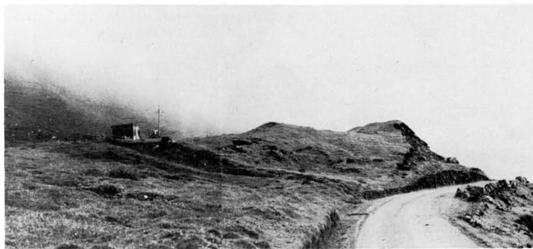
Fig. 2. Landslide south of Hvalba. Viewed from the south.

At the coal-bearing shale sequence at Botns-skard, in the westernmost part of Trongisvágstjørður on the south-east flank of the mountain Tindur, a fourth landslide (fig. 1, loc. 4) can be observed, just west of the entrance of the road tunnel and of a conspicuous fault. This landslide which is somewhat smaller than the northernmost one in the valley south of Hvalba, is situated between two lamellar zones. Its top is about 300 m a.s.l. and